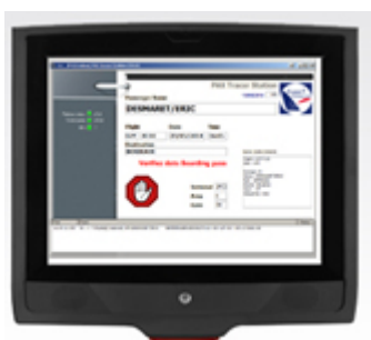
Integrated Bar Code Reader

It is then stored in PAXTracer database.